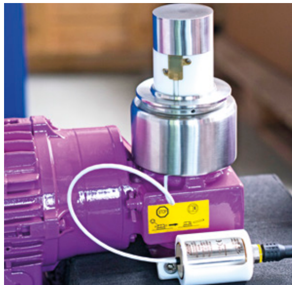
Two Hall probes are integrated in the tiny sensor housing

"In order to determine mixing capacity, the information we need includes the speed of the mixing head," explains AWH product manager Anja Hauffe. This is