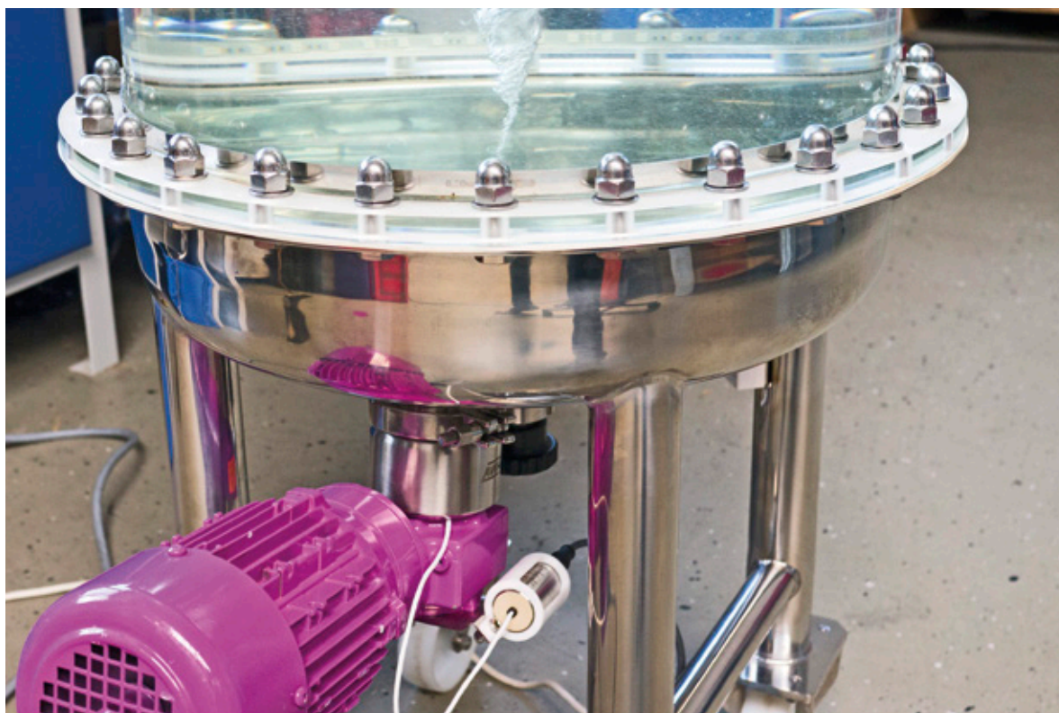
The new analog modules are particularly flexible for the different types of input signal