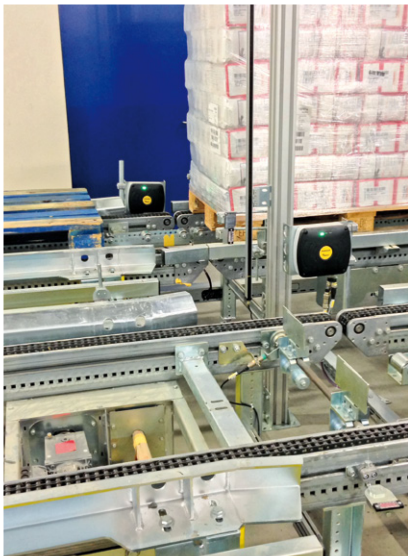
Neighbor conflicts excluded: Both read/write heads only read the pallets directly in front of them

Another unanswered question was the assignment of network addresses to the individual read/write heads