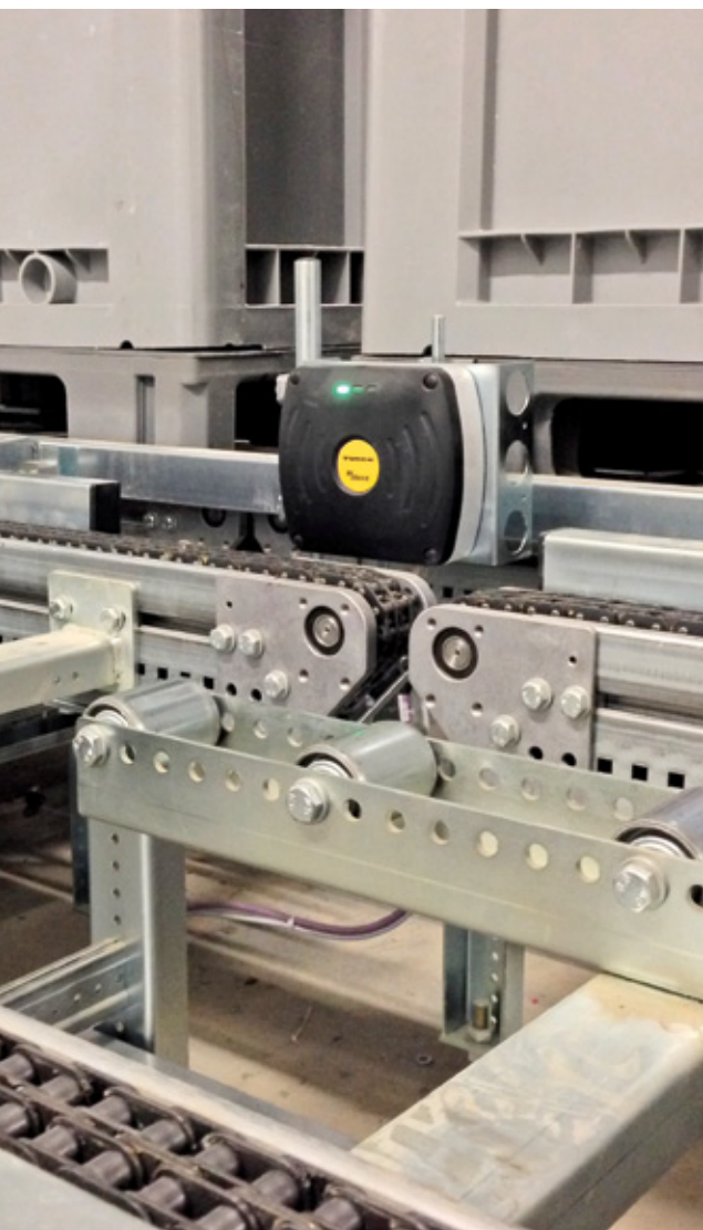
The LED indicates the status of the read/write head directly on the device

be used or you can restrict the number of read operations that the read/write head performs," Fuhrmann explains. The RSSI value specifies the strength of a signal. It is used to estimate the distance of a target. By setting filters, objects at a particular distance can be excluded from read operations.