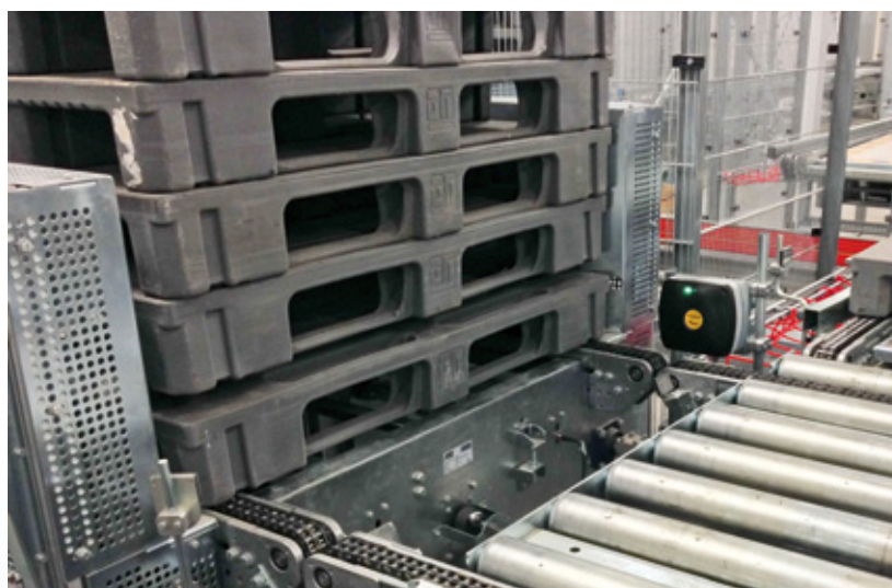
The plastic pallets come ex-factory with a UHF tag

Goods arrive at the goods-in bays of the “COOP-Logistikcenter” on pallets. The pallets are unloaded here and temporarily stored in the pallet store. The unmixed pallets are then depalletized fully or semi-automatically and transferred to trays or containers. Besides