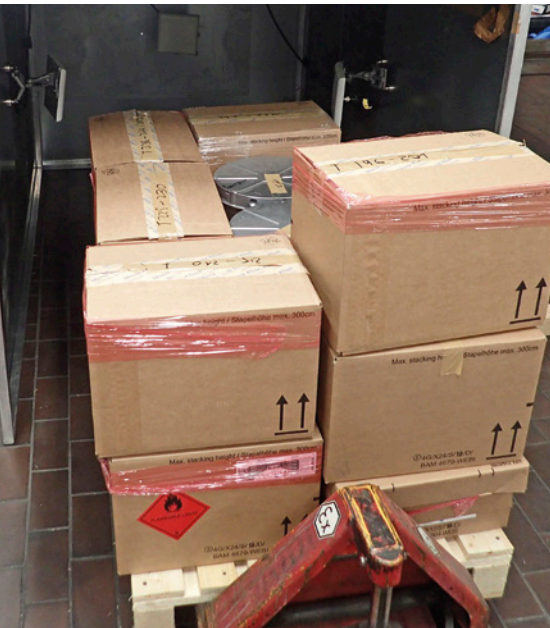
The shipment verification station even detects mixed pallets with different containers and randomly aligned tags reliably and at sufficient speed