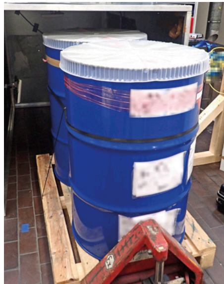
The on-metal tags use the drum itself as an extended antenna