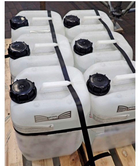
Polar liquids like ethanol are also reliably detected if the tag is positioned correctly

differed significantly in their dampening properties. Kleppinger looked for a different molecular property that differentiated the three solvents: The result of his study was the polarity of the materials was the critical factor. If this finding can be confirmed with further tests, this will represent a new level of research in future on the effect of liquids on readability with UHF-RFID.