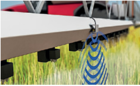
Turck's PTFE-coated ultrasonic sensors measure the distance between sprayer boom and field or crop and are resistant to commonly used plant pesticides