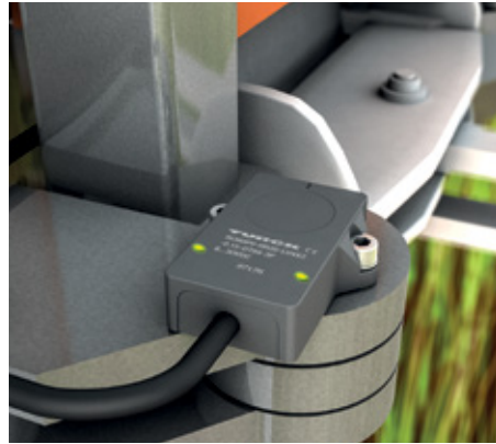
Contactless, wear-free encoders such as the QR20 encoder are suitable, for example, for use as angle sensors for the spray arms of field sprayers or as components of steer-by-wire solutions